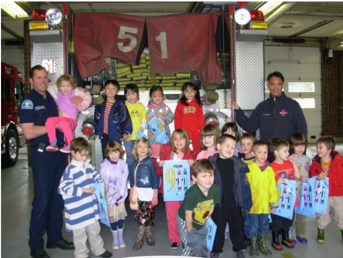
Inventors at Kenmore Fire Station

Looking forward to see all of you at the summer park days!