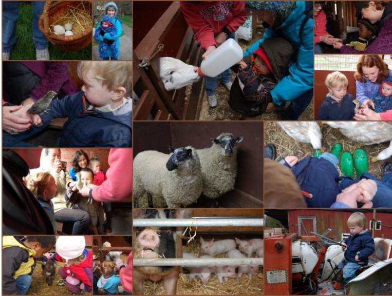
Discoverers Collage. Field Trip to Fairbanks Farm. Photo Collage courtesy of Erin Zachey

We had great field trips. We picked pumpkins, held baby chicks,