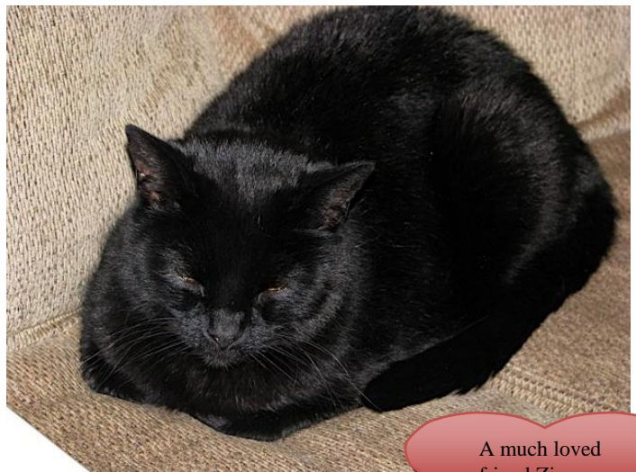
A much loved friend Ziggy