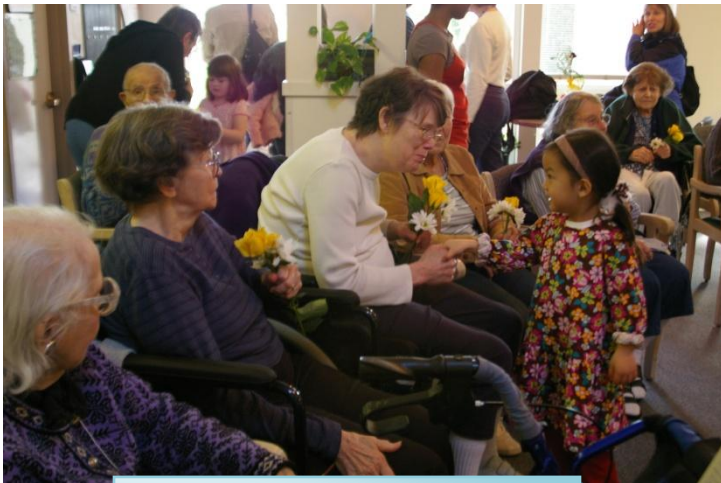
Inventor Grace delivers flowers & smiles to the residents of Foss Home